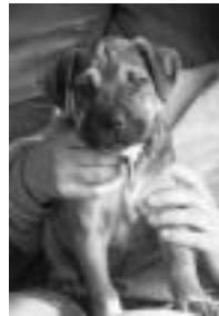
Foggy on Jean's lap.

There are thousands of us on the road every weekend, and some weekdays, crisscrossing the nation. We aren't going sightseeing or to visit friends and family. We are animal transporters. We haul dogs and cats, primarily, but also the occasional lizard, goat, pot-belly pig, etc. from kill shelters, foster homes, or owners who must give them up to rescues, foster homes, or new forever homes. We take the animals and all their worldly possessions, food, beds, crates, toys, bowls, blankies, collars, leashes, and medical records on our own time, at our own expense, in our own vehicles (and the increased gas prices hasn't slowed anyone down). In fact, Hurricane Katrina has increased